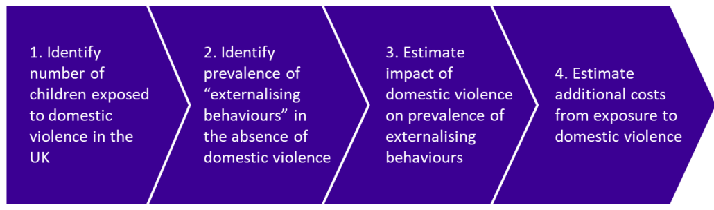
Figure 2: Overview of analytical approach

Our overall approach comprises four key steps, outlined in Figure 2: